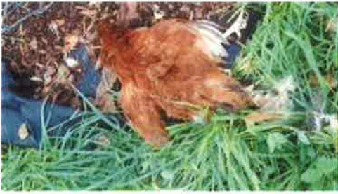
20171016_175008.jpg ~2.6 MB