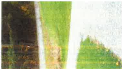
20171016_174025.jpg ~2.6 MB