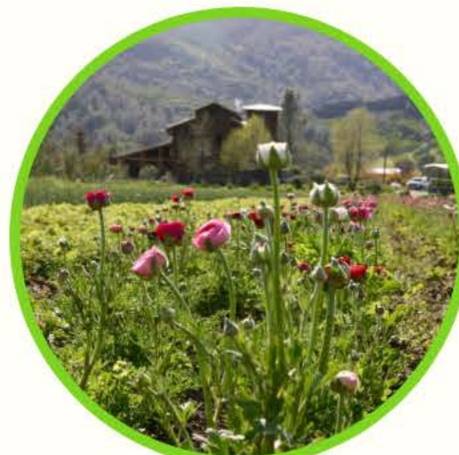
Full Belly Farm

*Option to Purchase at Agricultural Value - this easement (the first in Monkton!) predated the option for the next owner to purchase the conserved ag land at agricultural value (minus the development potential), so this easement was updated to help transfer The Last Resort Farm to the next generation. All other ag easements in Monkton have the OPAV included in current easement language.