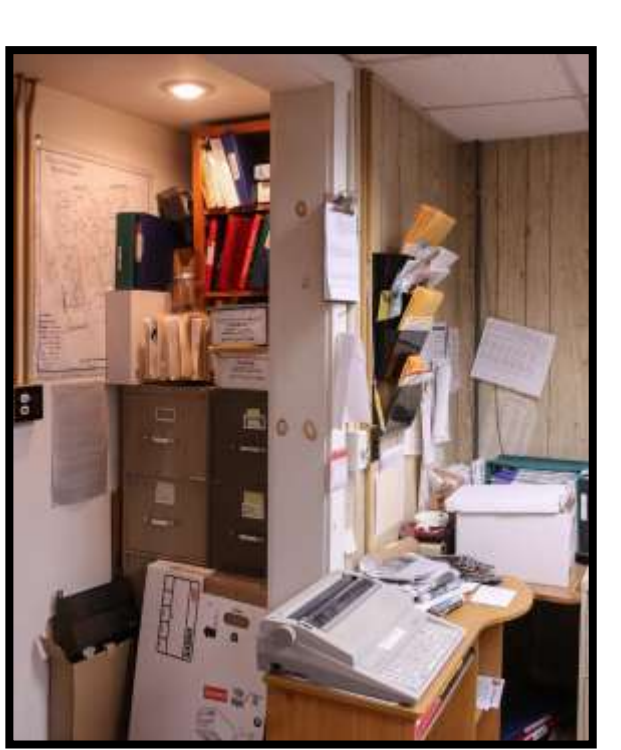
Storage space is needed in the Town Hall.