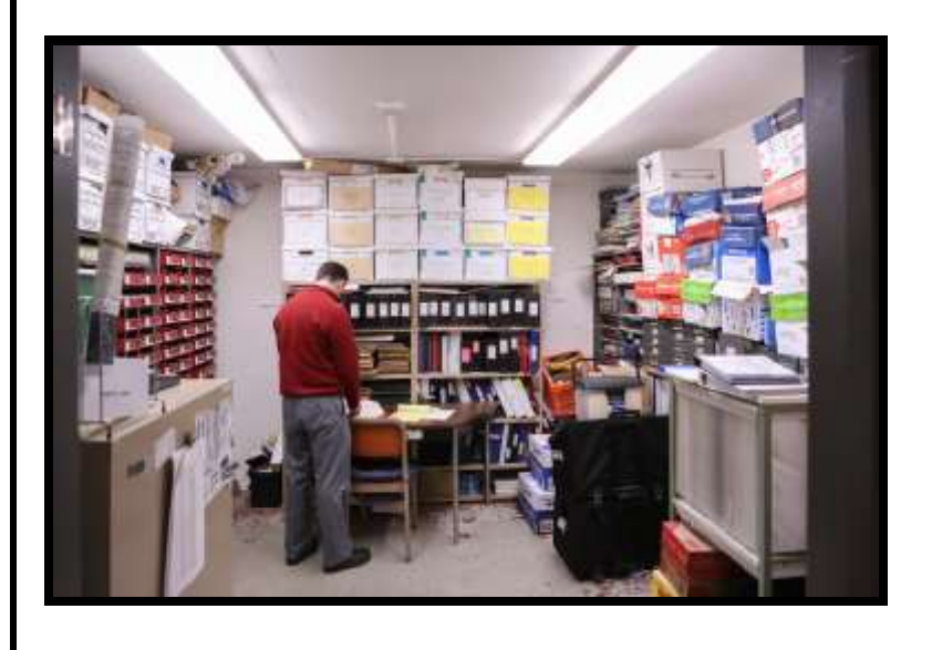
The Town Hall's vault is overflowing.