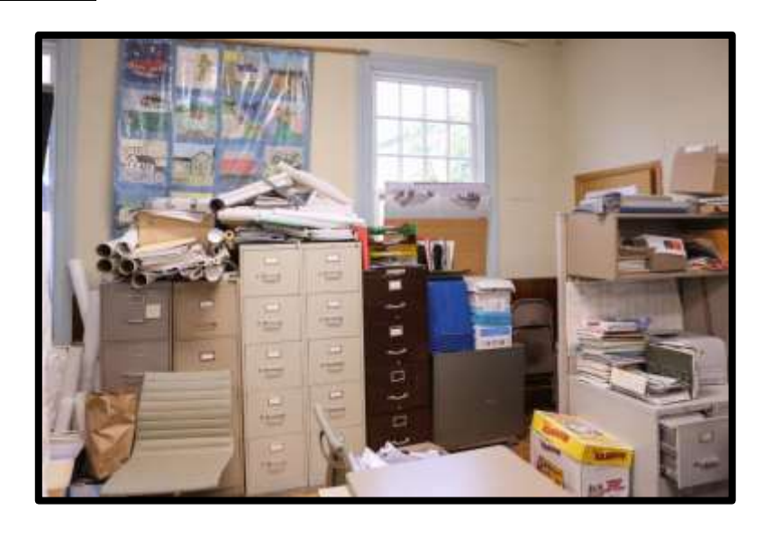
Space is needed to store large maps.